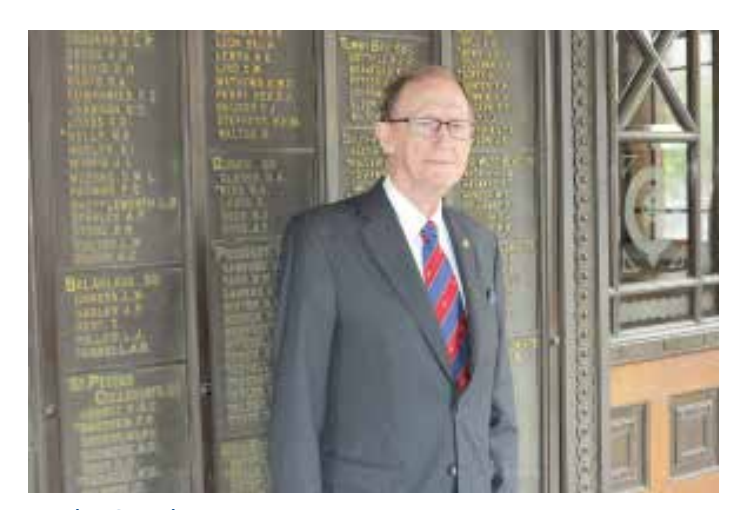
The Grand Master at the wall of remembrance, Grand Lodge

Lest we forget: VP Day message from the Grand Master On Saturday August 15 we witnessed a very moving ceremony to commemorate the anniversary of VP Day (Victory in the Pacific 75 years ago) in the War Memorial in Canberra.