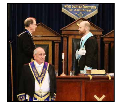
Above: Welcoming the Grand Master. Below: The address about early Scottish history of the Lodge.