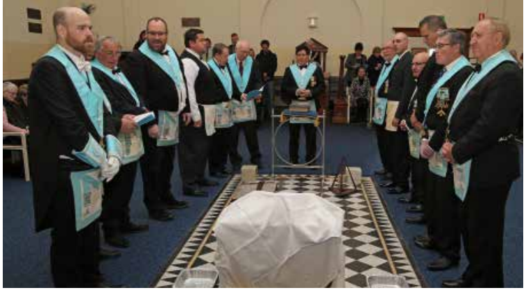
The Adelaide Lodge No. 2 members in place for the ceremony.